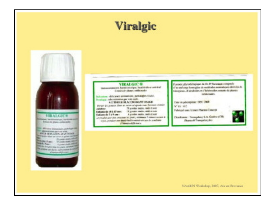
Figure 1. Viralgic, West Africa.