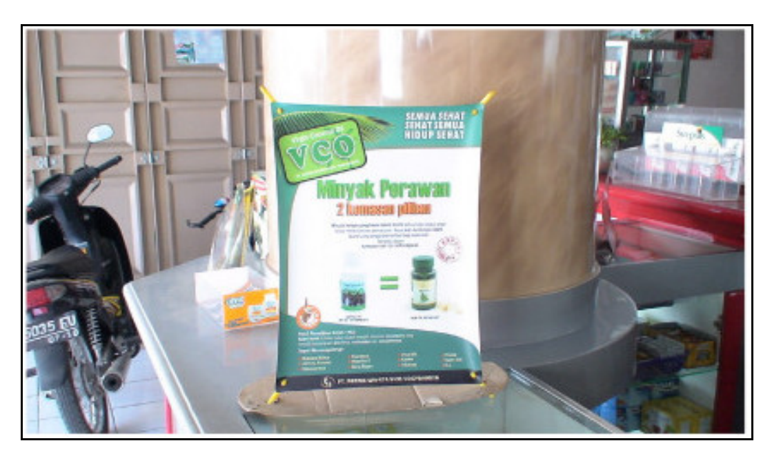
Figure 3. VCO, Indonesia.